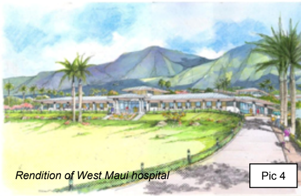
Rendition of West Maui hospital