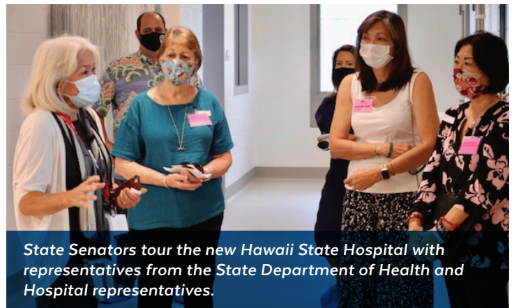
State Senators tour the new Hawaii State Hospital with representatives from the State Department of Health and Hospital representatives.