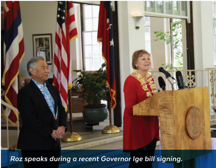
Roz speaks during a recent Governor Ige bill signing.

* ARPA ( American Rescue Plan Act ) funds