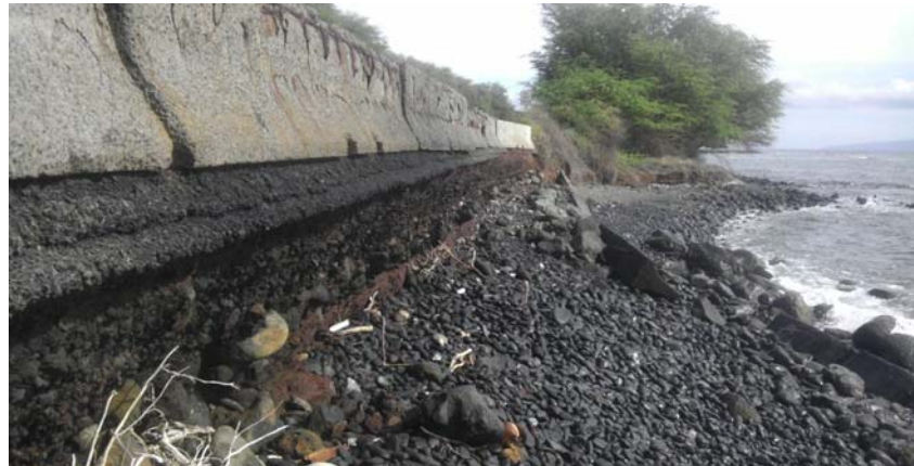
For additional photo's please visit www.WestMaui.org